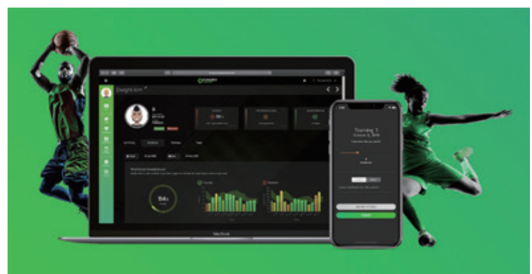
Komodo Monitr Platform

We currently have paying customers across multiple regions such as New Zealand, Australia, Spain and Israel. A majority of these are high schools, but this also includes sporting organisations and teams. In total we have 1,100 active paying users with another 8 organisations on trial.