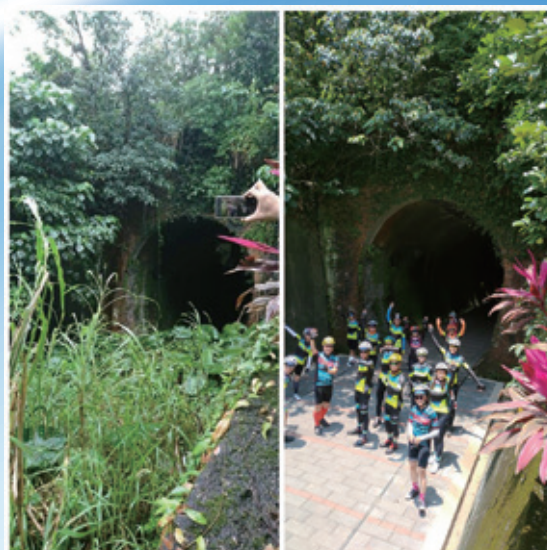
Wudu Tunnel then and now

Website: https://topcycling.uni-net.com.tw/