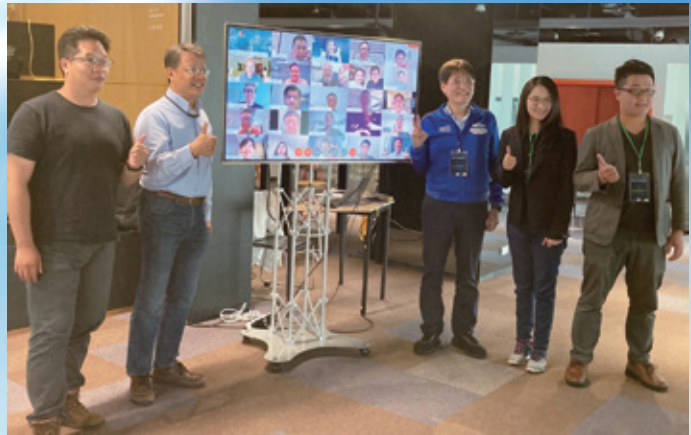
Group photo at HYPE SPIN Accelerator Taiwan's 4th training cycle launch